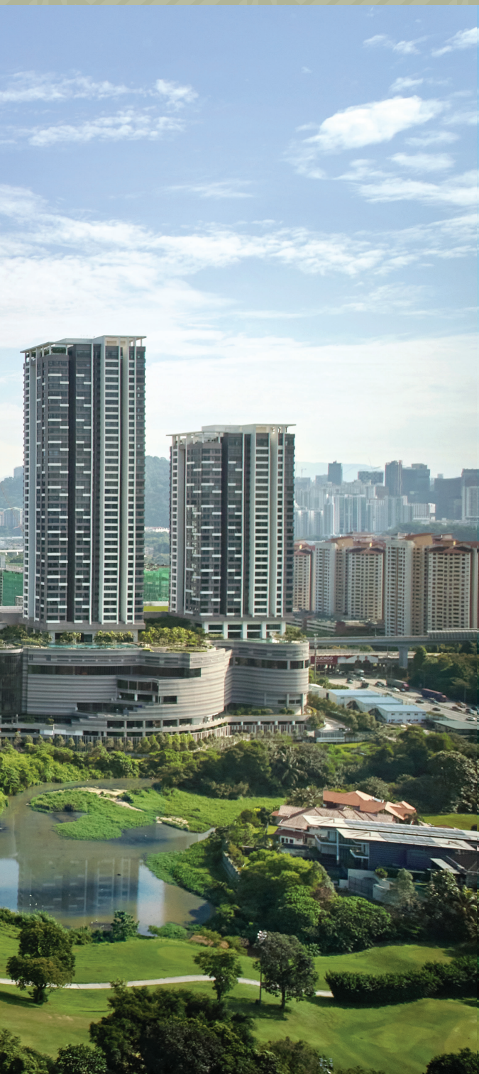
WITHIN KOTA DAMANSARA'S SWEET SPOT OF CONVENIENCE AND VIBRANCE WITHIN A BRANDED ADDRESS