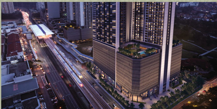
CONVENIENCE SET STEPS AWAY WITH LINK BRIDGE TO TROPICANA GARDENS MALL AND SURIAN MRT STATION