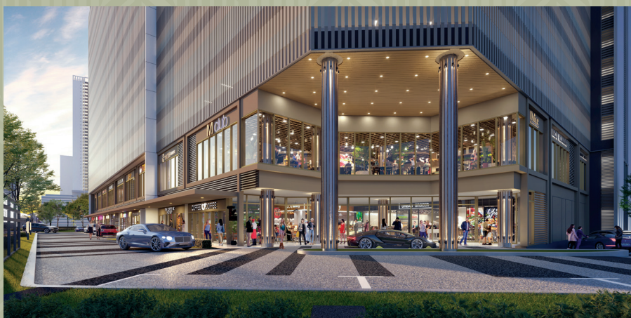
TWO FLOORS OF VOLUMINOUS COMMERCIAL SPACES WITH HIGH VISIBILITY FROM THE MAIN ROAD